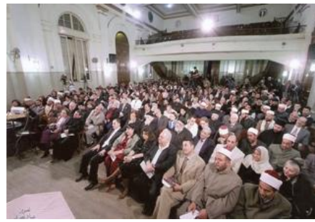
A picture of the panelists and the audience

Different viewpoints were exposed in an atmosphere of honesty and respect. The panelists were delighted to see that the MECC has proven to be an oasis of dialogue and trust building in Egypt and the Arab world.