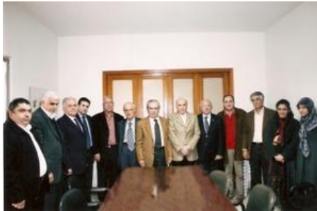
The Elected board members

relief and development work in Lebanon during and after the Lebanese civil war. The NGO network is engaged in a series of meeting with the high Lebanese officials to introduction its plan of action. Lately they met with the president of the Lebanese republic and the minister of social affairs.