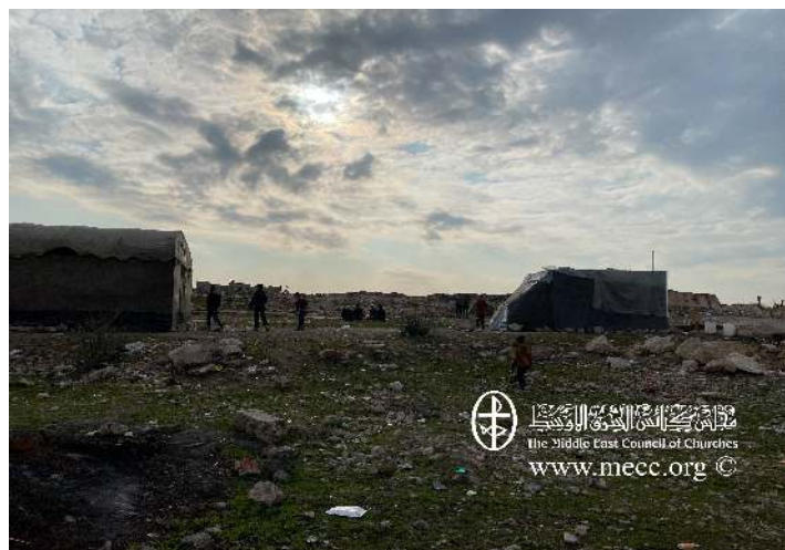
Album 4- Photos Showing the Bitter Humanitarian Situations in Syria