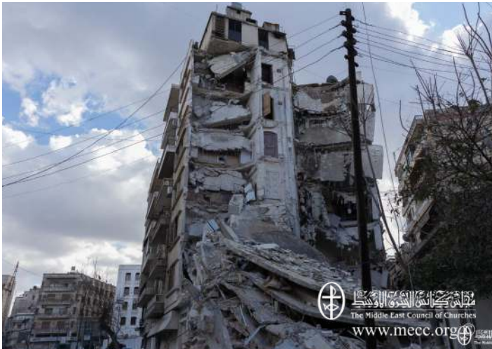
Album 1- The Scenes of Destructions in Syria In Some Photos