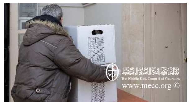
Distribution of food and hygiene kits in Aleppo

MECC also provided me with a healthy ration and a food basket."