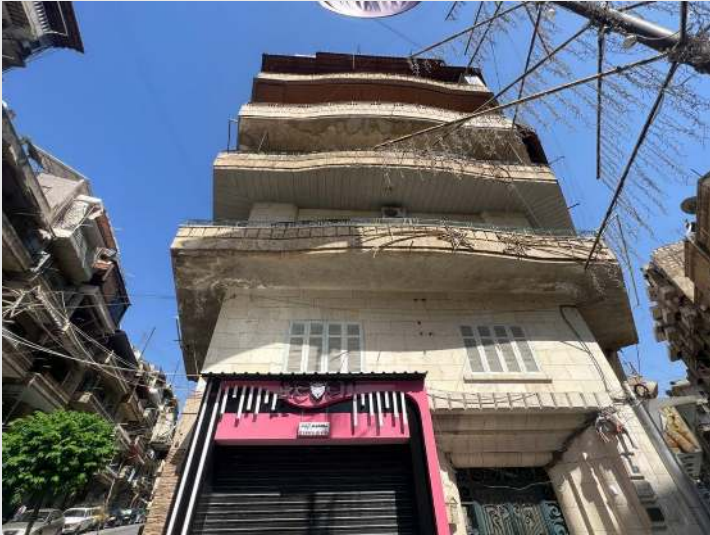
Building No 1369 in Azzizieh area