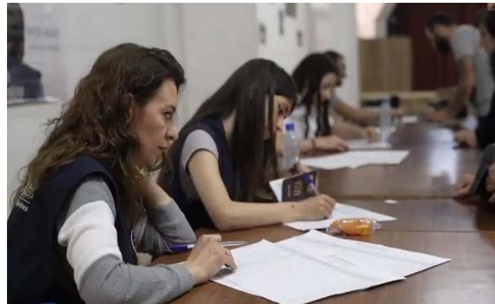
9- Video - A New Batch of Aid Heals the Wounds of the Affected People Due the Earthquake in Syria