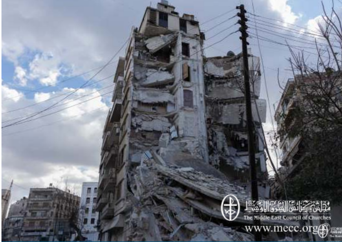
Album 1- The Scenes of Destructions in Syria In Some Photos Taken by MECC