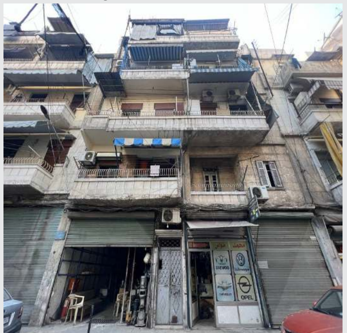
Building No 5262 in Soulimanieh area