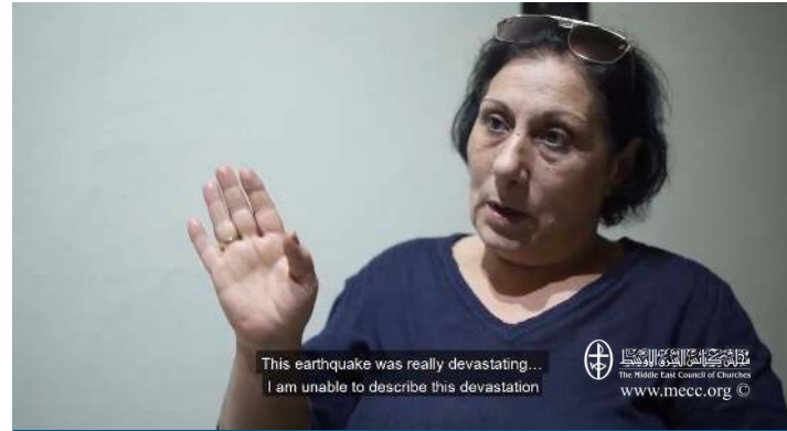
7 - Syria is Still Crying Out in Pain After the Earthquake that Struck the North of the Antiochian Levant A Survivor Reports the Bitter Situations She Passed Through Following the Disaster