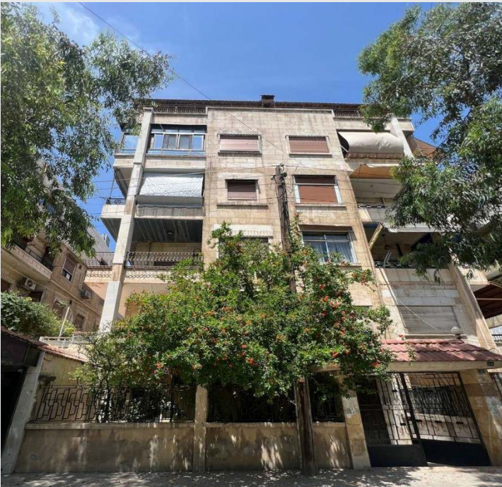
Building No 1733 Villat area