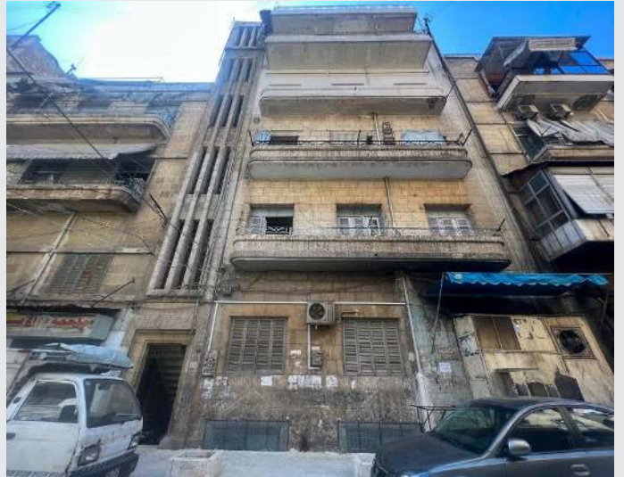
Building No 1454 Baghdada station