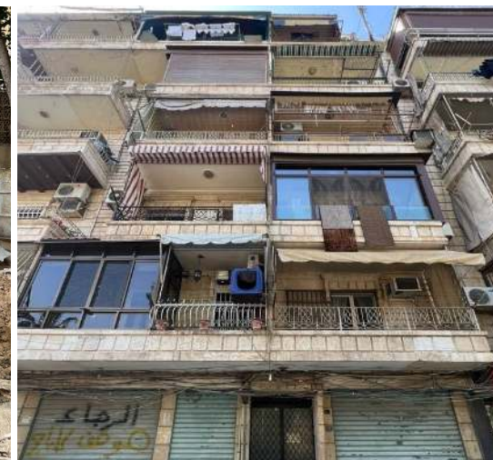
Building No 1362 in Villat Sharkieh area