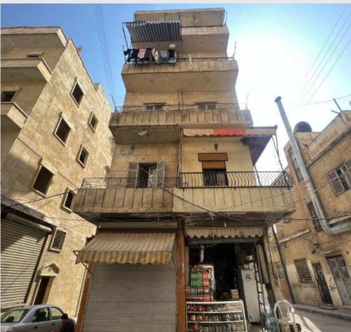
Building No 4587 Old Syriac area