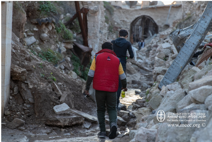
8- Video - Following the Earthquake that Shook the North of the Antiochian Levant Survivors in Syria Remember the Most Difficult Moments