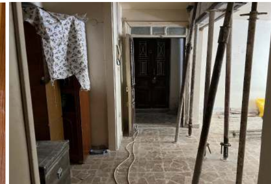
Number of some buildings that will be retrofitted soon: