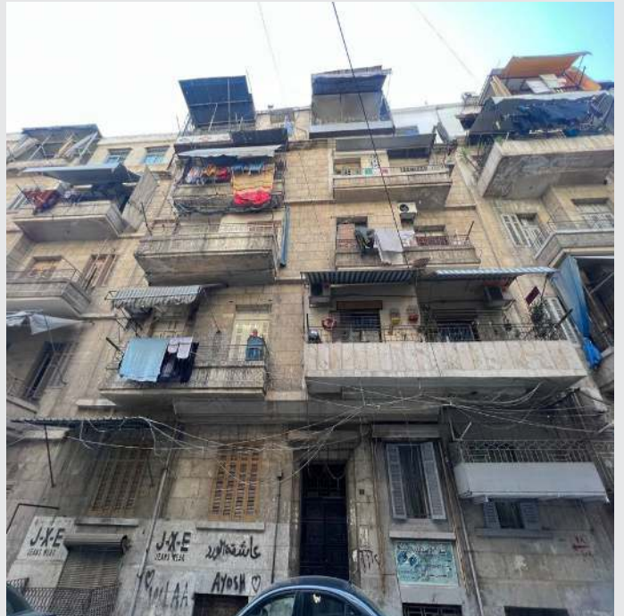
Building No 6662 in Sloulimanieh area