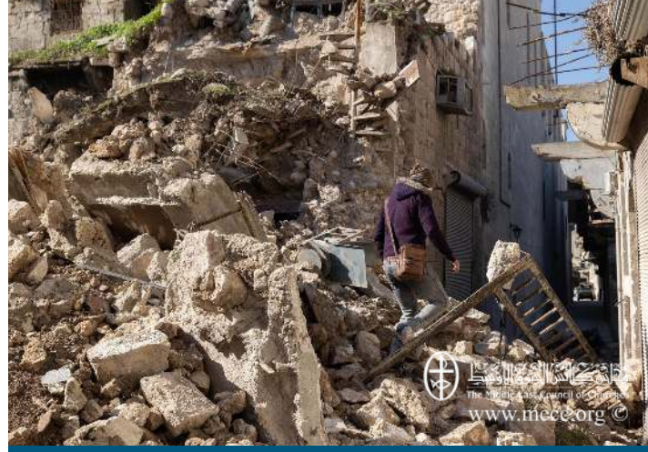
Album 2- Difficult Humanitarian Conditions in Syria New Photos Shows the Massive Disaster