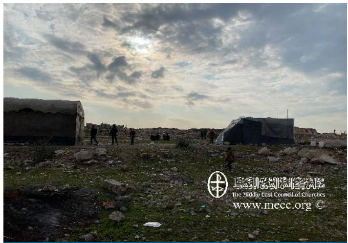
Album 4- Photos Showing the Bitter Humanitarian Situations in Syria