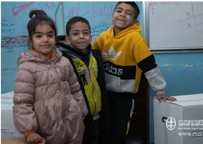
Album 3- Photos from the Heart of the Tragedy in Syria