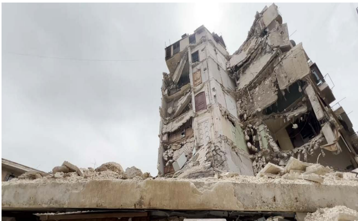
10- Video - Syria is Still Wounded One of the Earthquake' Survivors in Aleppo Remembers the Bitterness of the Disaster's First Moments