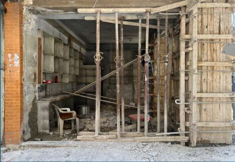
MECC technical team observing the technical work during their monitoring visits to Aleppo

MECC has assessed 1360 buildings to date. Out of 1360 buildings, there are 15 buildings with high damage that require evacuation of inhabitants, 1151 buildings that have minor damage inside apartment without any damage of building structures, 192 buildings with moderate damage that require technical retrofitting studies to be safe. MECC has already begun to retrofit 13 buildings and another 8 buildings are under procurement process to be retrofitted in the coming two weeks. Technical studies of other selected buildings are in process in order to outreach the target which is 40 affected buildings. Given the fact that each building has a unique technical condition and level of damage, providing adequate retrofitting solutions takes time and consultancy with many experts prior to getting the approval of the municipality and engineering syndicate in Aleppo. Additionally, the rare technical contractor who can meet the required technical works represents a challenge today. Nevertheless, MECC managed to follow its action plan accordingly. The below photos show part of the technical work to strengthen the affected structures of some selected buildings.