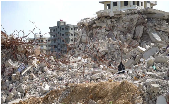
11- Video - Jableh Region Facing the Repercussions of the Earthquake that Hit the North of the Antiochian Levant