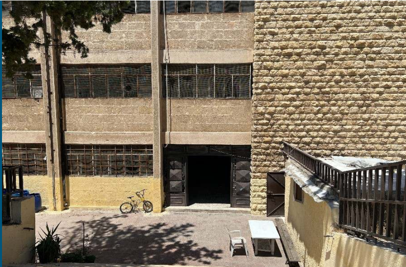
Fowzi Jisri school in Aleppo

MECC completed the rehabilitation studies and procurement of two affected public schools in Aleppo in addition to other three schools which are under technical studies.