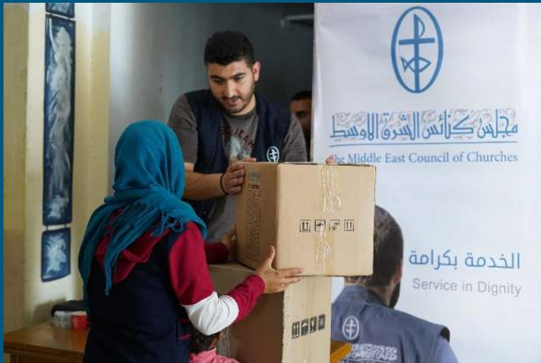
Distribution activities in Jableh and Hama surrounding villages