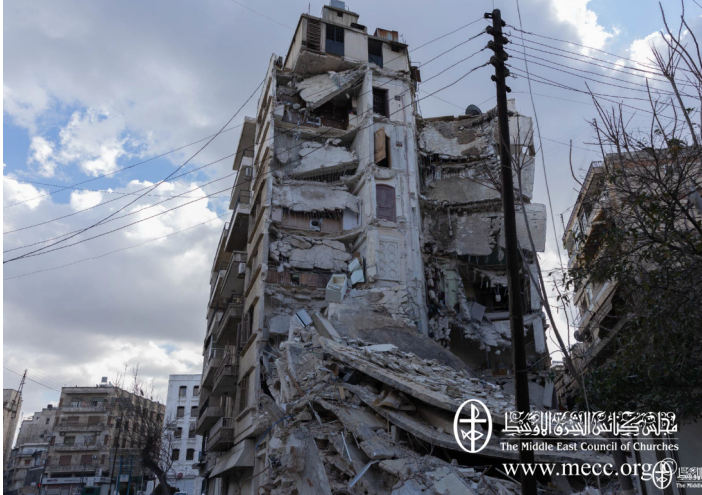
Album 1- The Scenes of Destructions in Syria In Some Photos Taken by MECC