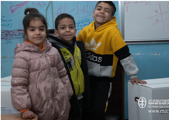
Album 3- Photos from the Heart of the Tragedy in Syria