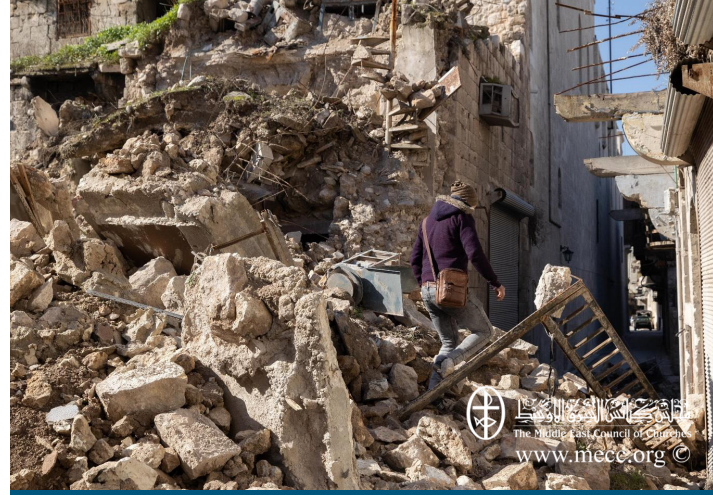
Album 2- Difficult Humanitarian Conditions in Syria New Photos Shows the Massive Disaster