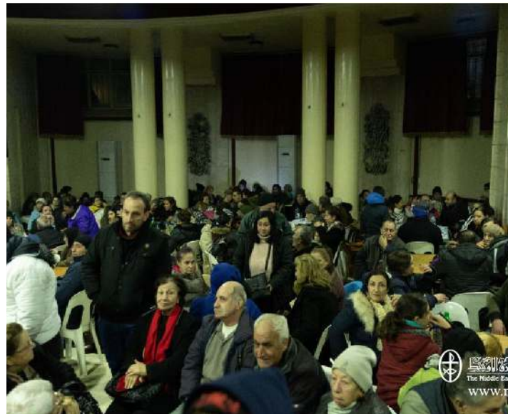
Serving food by volunteers to people