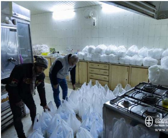
Survivors from the earthquake are using churches halls as shelters