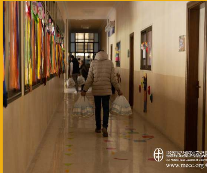
Schools are used as shelters to host survivors from the earthquake