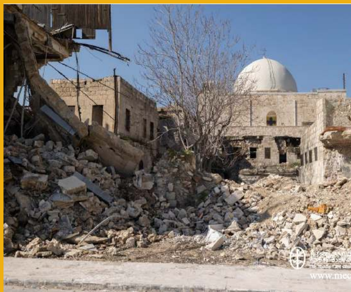
Damaged buildings in the old city of Aleppo nearby rehabilitated churches