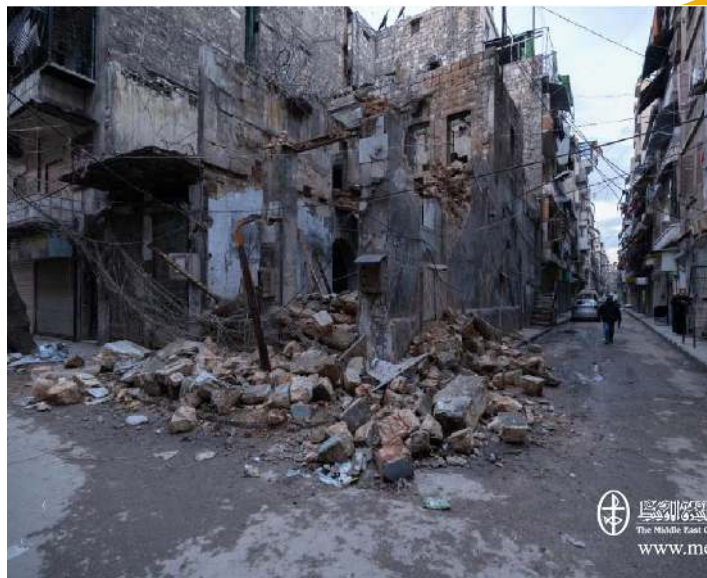
Damaged buildings inside Aleppo city