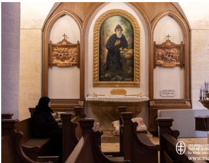
Churches are opened as shelter for all people