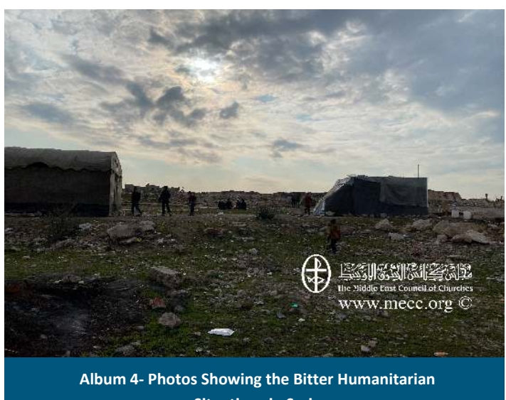
Situations in Syria