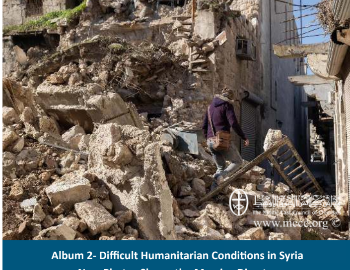
New Photos Shows the Massive Disaster