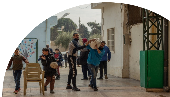
People helps each other while they stay in public shelter

There has been no largescale destruction in Damascus and Rural Damascus. However, last night (8 February) a four-story residential building collapsed in Harasta (Rural Damascus). There were initial reports of two casualties.